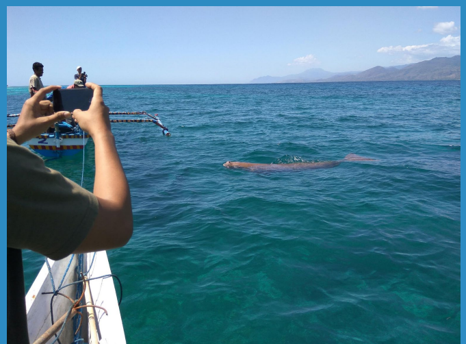
Figure 1: Dugong sighting at Alor MPA.

The Lesser Sunda is influenced by Indonesian Throughflow from the western Pacific water and Indian Ocean as well as upwelling currents. It contains small islands, seamounts, deep seas and canyons. This area is an IMMA because of the existence of small and resident populations of vulnerable species, the dugong, dugong feeding areas and species diversity.