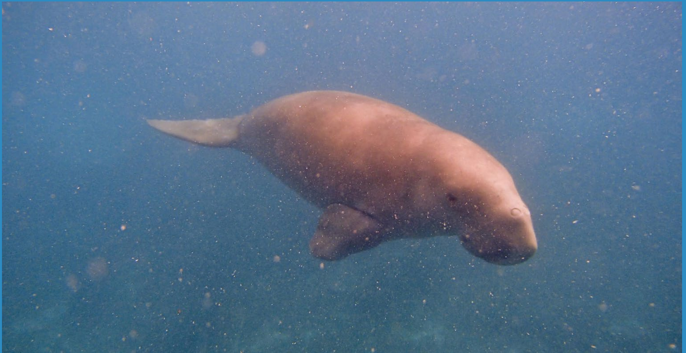
Figure 2: Dugong in Alor MPA.