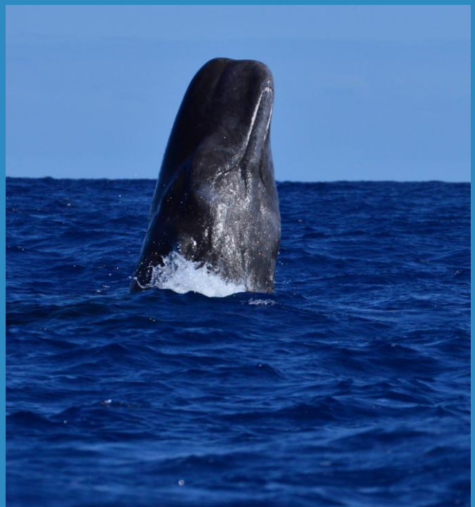
Figure 4: Sperm whale ( Physeter macrocephalus ) breaching.