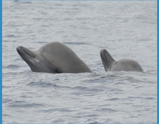
Figure 18: A pair of northern bottlenose whales ( Hyperoodon ampullatus ) surfacing off Pico Island.