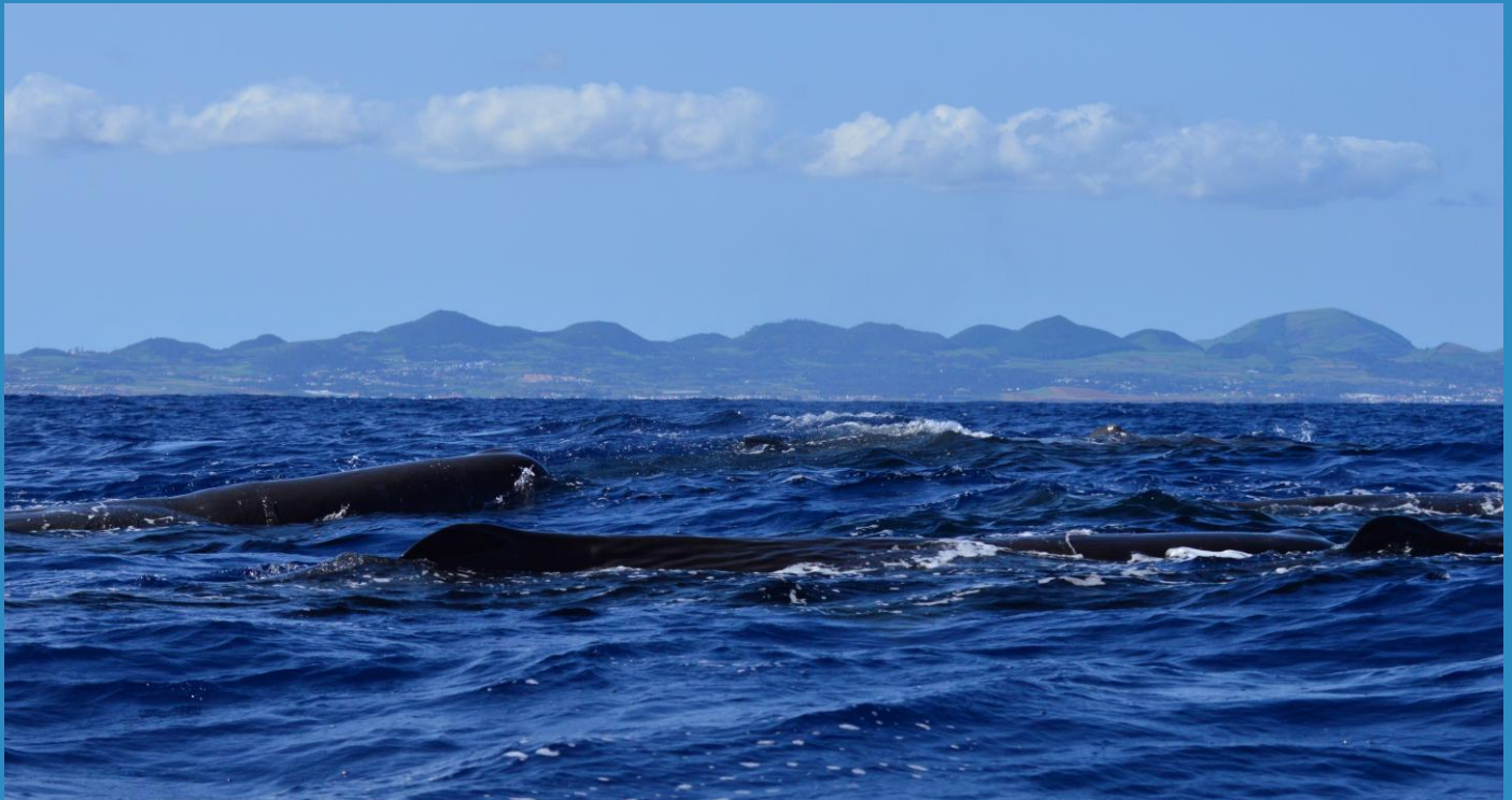
Figure 9: Sperm whales ( Physeter macrocephalus ) in the Azores.