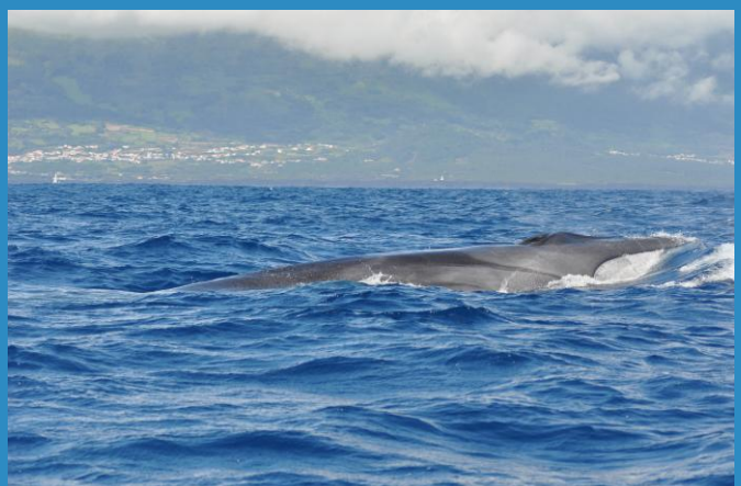
Figure 5: Fin whale ( Balaenoptera physalus ) surfacing near shore of Pico Island, Azores.