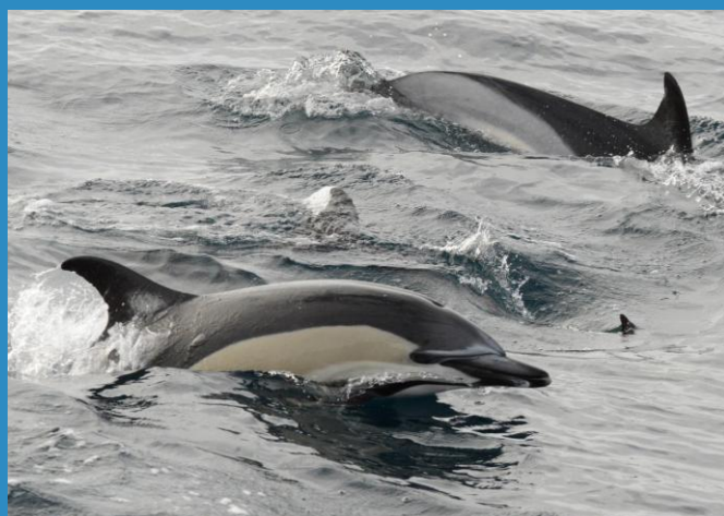
Figure 14: Common dolphins ( Delphinus delphis ) in the Azores.