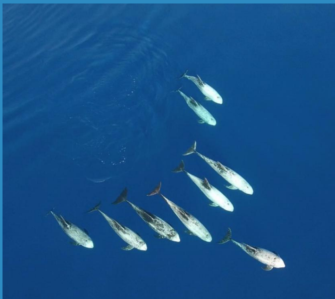
Figure 12: Risso's dolphins ( Grampus griseus ) aerial view in the Azores.

intra-group male-male collaborations (Hartman et al., 2020). Male Risso's dolphins have been frequently observed to conduct consortships, which is considered to be a driver of the rare existence of non-kin but stable associated multi-male groups in the research area (Hartman et al., 2023).