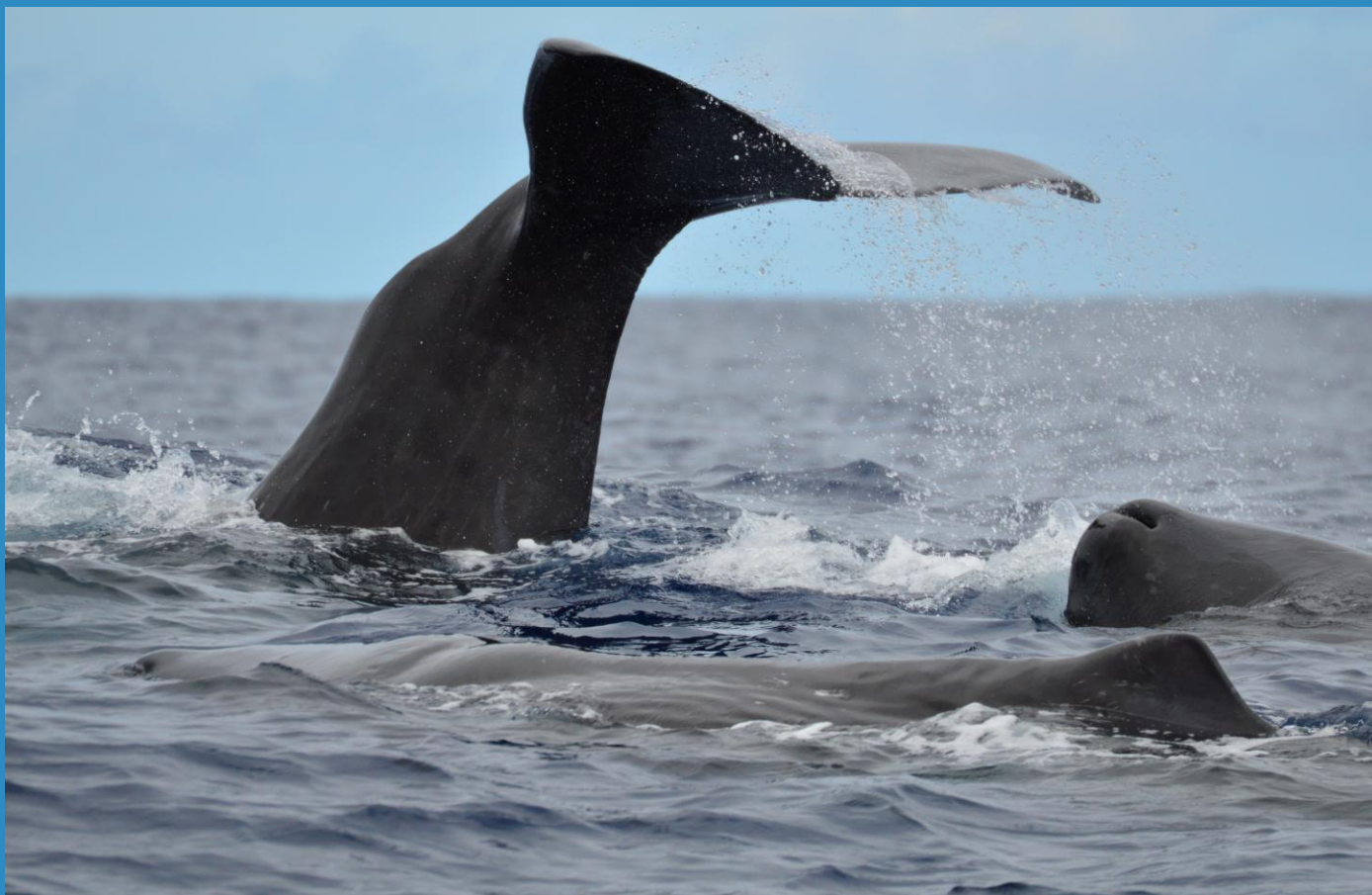
Figure 7: Sperm whale ( Physeter macrocephalus ) fluke seen in the Azores IMMA.