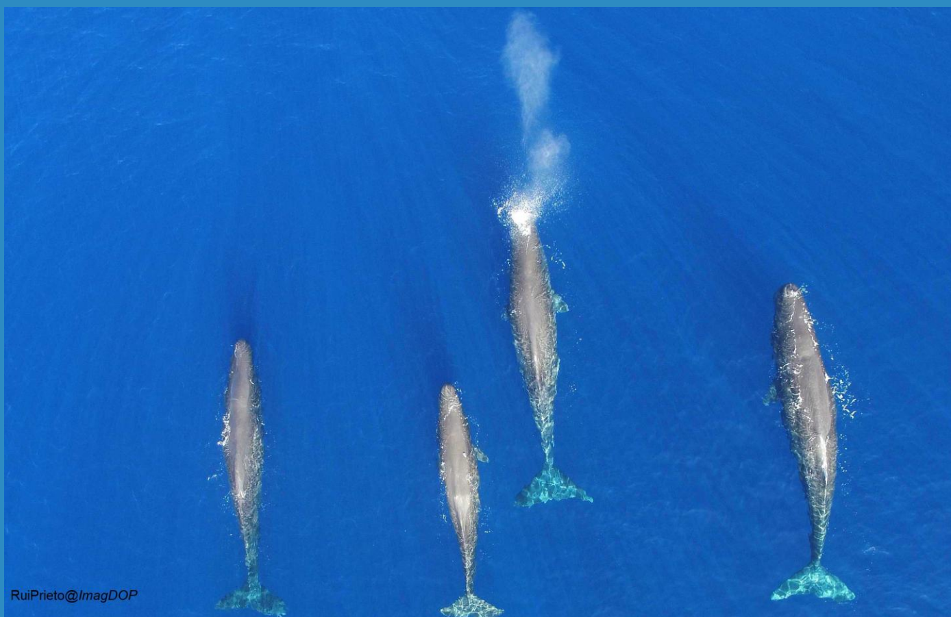
Figure 8: Aerial view of sperm whales ( Physeter macrocephalus ) in the Azores IMMA.