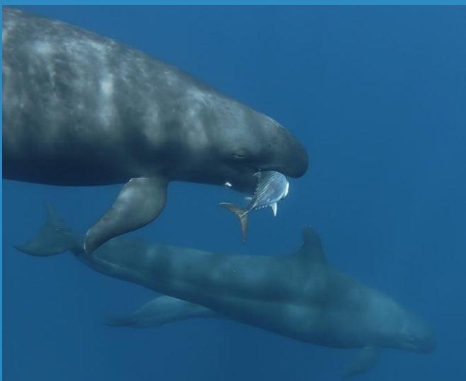
Figure 17: False killer whales ( Pseudorca crassidens ).