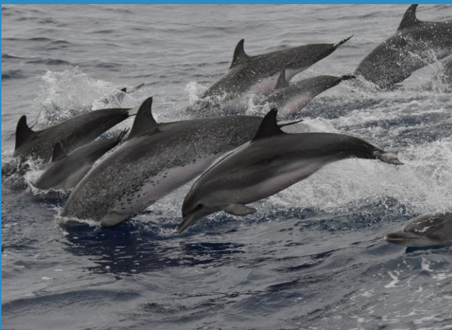
Figure 16: Atlantic spotted dolphins ( Stenella frontalis ).