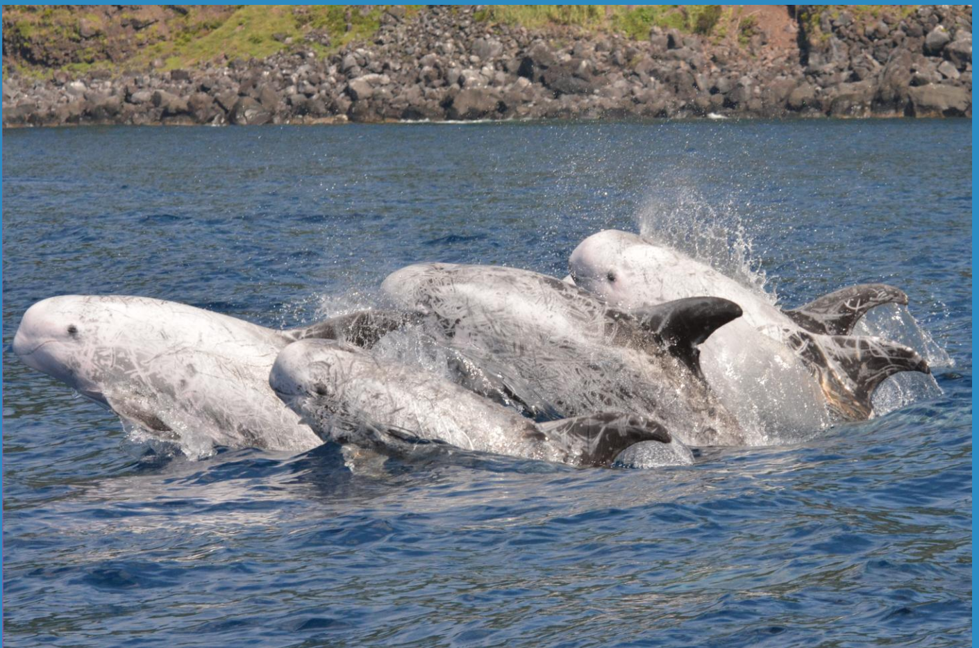
Figure 6: Risso's dolphins ( Grampus griseus ) breaching.

unpublished data). This corroborates a previous study based on data collected over 35 consecutive months (May 2004 – November 2007) that showed that this population was resident year-round in the area (Hartman et al., 2015). Home range analysis of frequently sighted individuals revealed core habitat areas within 4-nautical miles south of Pico Island (Hartman et al., 2014, 2015). Within this area, females with neonates and nursing calves appear to use coastal waters most frequently, often less than 100 m from the shore, whereas sub-adult and adult groups (mixed sex or males only) occupy slightly more offshore waters (Hartman et al., 2015). During the nursing period, between June and August, sub-adults, pregnant females, and females with neonates and older calves often cluster together in nurseries, occupying restricted core areas (Hartman et al., 2014).