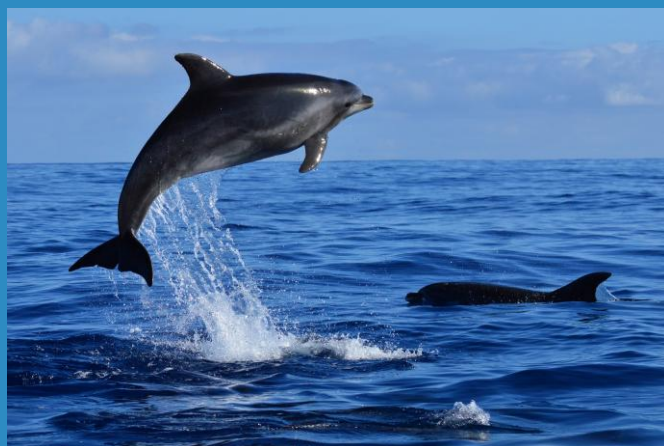
Figure 13: Common bottlenose dolphins ( Tursiops truncatus ) leaping in the Azores.

Sightings of dwarf ( Kogia sima ) and pygmy sperm whales ( Kogia breviceps ), Gervais' ( Mesoplodon europaeus ) and True's beaked whales ( Mesoplodon mirus ) are rare but strandings suggest that these taxa are present year-round and possibly in higher numbers than revealed by sighting information (Silva et al., 2014). In addition, long-finned pilot whales ( Globicephala melas ) and rough-toothed dolphins ( Steno bredanensis ) are occasionally recorded in the area.