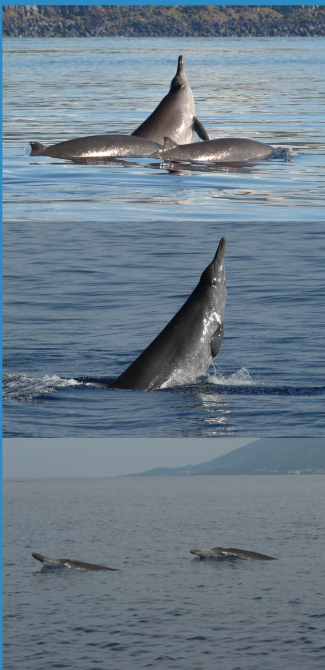
Figure 11: Sowerby's beaked whales ( Mesoplodon bidens ) observed surfacing off Pico Island.

Beaked whales (Ziphiidae) are frequently sighted around the Azores islands as well as in more offshore waters (Silva et al., 2014; Tobeña et al., 2016). Although no population estimates are available for the whole archipelago, estimates of beaked whale density from the ship line-transect survey around the central islands of the Azores were considerably higher than those in neighbouring regions (archipelagos of Madeira and Canary Islands) (Freitas et al., 2019), suggesting that the Azores hosts important aggregations of multiple beaked whale species. This is especially the case for Sowerby's beaked whale ( Mesoplodon bidens ), with an estimated abundance of 605 whales (CV=28%, 95%CI: 355-1,032) in the 32,804 km 2 survey area (<24% of the IMMA) (Freitas et al., 2019), giving an estimated density of 0.018 whales/km 2 . These estimates were not corrected for availability or perception bias and therefore are very likely underestimates.