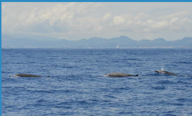
Figure 10: Sowerby's beaked whales ( Mesoplodon bidens ) in the Azores.