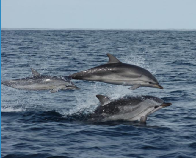
Figure 15: Striped dolphins ( Stenella coeruleoalba ) in the Azores.