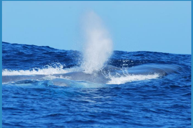
Figure 3: Blue whale ( Balaenoptera musculus ) blows.

Blue whales ( Balaenoptera musculus ) and sei whales ( Balaenoptera borealis ) are currently listed as Endangered on the IUCN Red List of Threatened Species (Cooke, 2018a, b), and fin whales ( Balaenoptera physalus ) (Cooke, 2018c) and sperm whales ( Physeter macrocephalus ) as Vulnerable (Taylor et al., 2019). The European regional Red List considers sperm whales as Vulnerable, while blue, sei and fin whales are considered Endangered (Cabral et al., 2005). The region is a well-known feeding and calving ground for sperm whales, and evidence suggests it serves as mid-latitude foraging habitat for fin, blue and sei whales during spring migration (Clarke, 1993; Prieto et al., 2014; Silva et al., 2013, 2014, 2019; González García et al., 2018, 2022; Pérez-Jorge et al., 2020). Additionally, these last three species have been acoustically detected around the archipelago in autumn and winter (Romagosa et al., 2020).